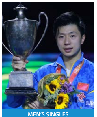
MA Long (CHN)