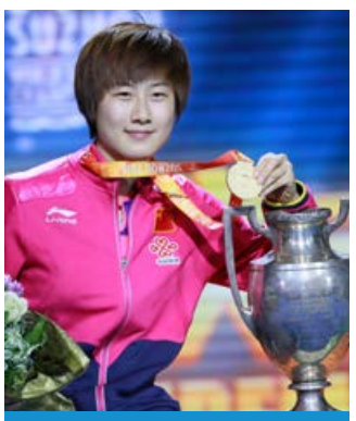
WOMEN'S SINGLES DING Ning (CHN)